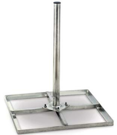
Patio Mount Aluminum TA001