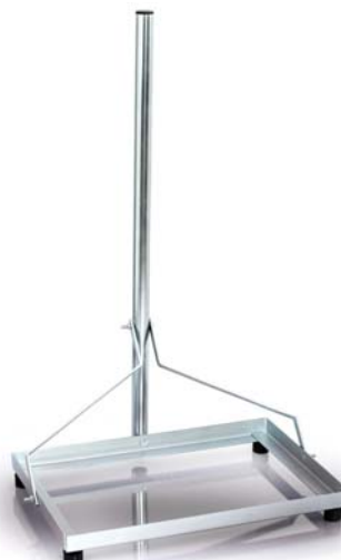
Patio Mount T006 (ST40)