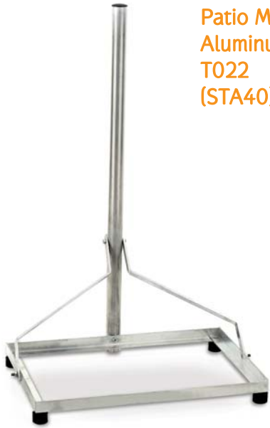
Patio Mount Aluminum T022 (STA40)