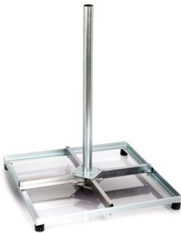
Patio Mount T002