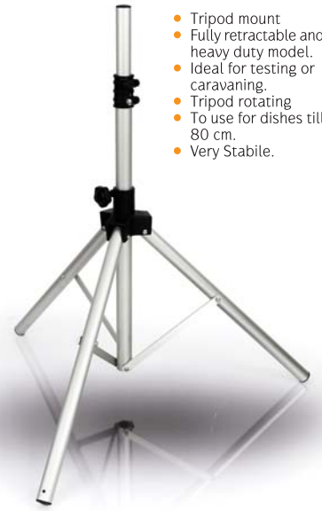
Tripod in box A009