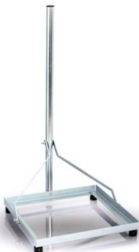
Patio Mount T006 (ST50)