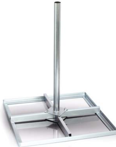
Patio Mount T001